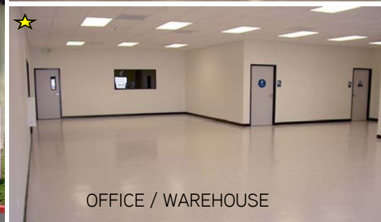
OFFICE / WAREHOUSE